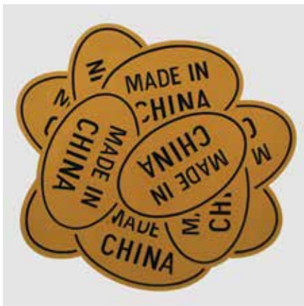
Ben Pratt, Made in China Cluster , 2016, acrylic on canvas, 47 x 47 inches