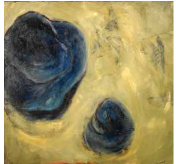
Ann McTaggart, Nurture II , 2008, oil and acrylic on canvas, 46 x 48 inches courtesy of the artist

In addition to sharing some of their most creative artworks with the Art Center's visitors, the artists are asked to think about the role that the drive to create plays in their lives. The creation of art is as difficult as it can be fulfilling, an activity usually performed in isolation that is then, if all goes well, presented for public scrutiny. With all the challenges that go into the making of art, why do our local artists devote themselves to it? Come find out for yourself how they address this question and how much fantastic art is produced in Sioux City.