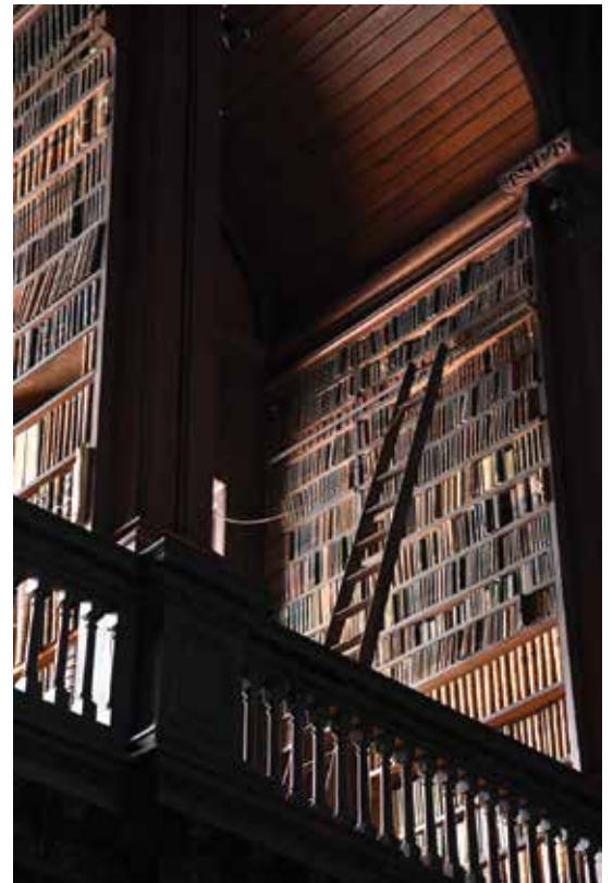
Michael Crowley, The Stacks in Long Hall, Trinity College, Dublin, IE , 2016, photograph, 17 x 11 inches