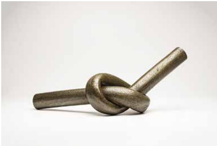
Christopher Meyer, Black Knot , 2016, cast iron, 9.5 x 24 x 10 inches

The exhibition includes artworks by local and regional artists that are featured in the 2017 edition of The Briar Cliff Review , Briar Cliff University's award-winning journal of articles, essays, poetry, photography, and art. The exhibition is an eclectic gathering of mediums and styles, presented as a sampling of many of the artistic trends occurring in the region.