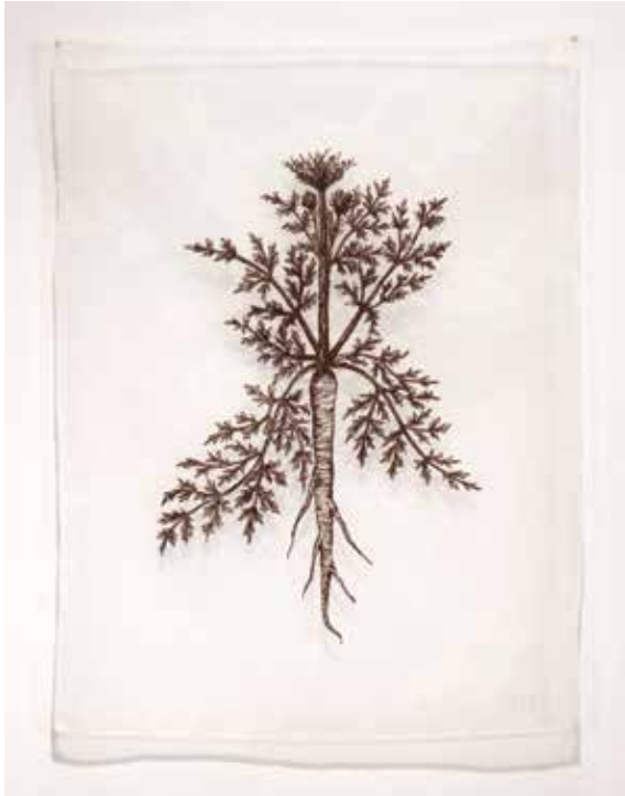
Carrot, 2017, thread and organza, 14.25 x 11 inches

The Art Center is pleased to return to one of its most popular recent project, Sioux City Art Center Selects . Sioux City Art Center Selects is a regional juried exhibition, open to all artists in Iowa, as well artists living within 300 miles of Sioux City. Unlike traditional juried exhibitions that ask jurors to select individual artworks based on their merits, Sioux City Art Center Selects asks artists to submit a body of work, which is then be judged by the overall quality of the artworks and by the clarity and consistency of the body of work. The Art Center's director, Al Harris-Fernandez, and curator, Todd Behrens, selected 8 artists from the 123 artists who applied. After visiting each artist's studio, the curator works with the artist to select a body of work to bring to the Art Center for this exhibition. The exhibition, therefore, presents visitors with a better understanding of how artists in our region are thinking and creating right now.