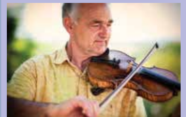
Paul Imholte

Don't miss Paul Imholte, opening each day of ArtSplash and wandering the festival grounds!